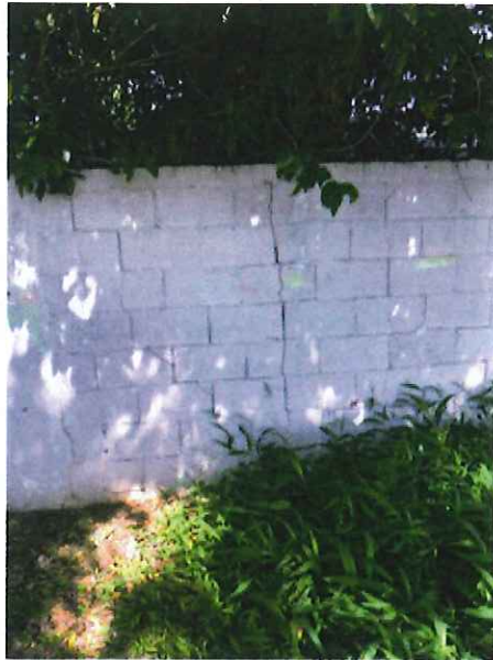
Figure 9 – Masonry site perimeter wall with cracks