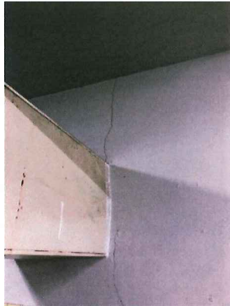
Figure 6 – Kitchen wall ventilation conduit penetration cracks