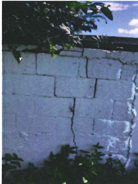
Figure 8 - - Masonry site perimeter wall with cracks