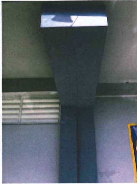
Figure 11 – Crack in joint between columns and beam