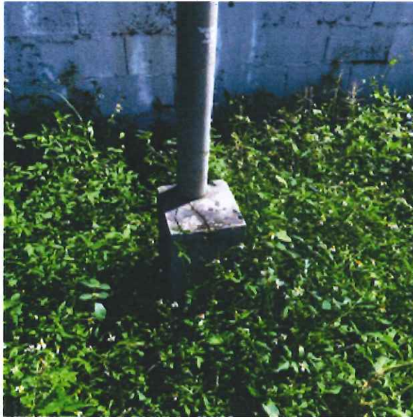
Figure 7 – Site court light post bend and crack footing. Possible failure