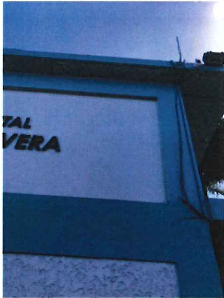
Figure 2 – wall crack at entrance façade wall