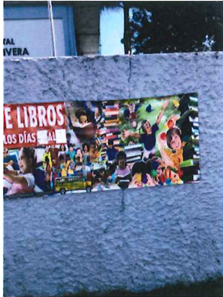
Figure 1 – Perimeter entrance wall with crack