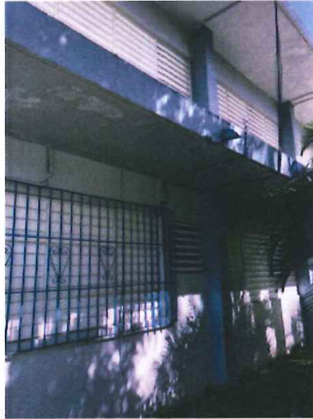
Figure 3 - short columns with no cracks detected