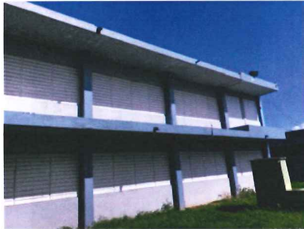
Figure 4 – short columns with no cracks detected