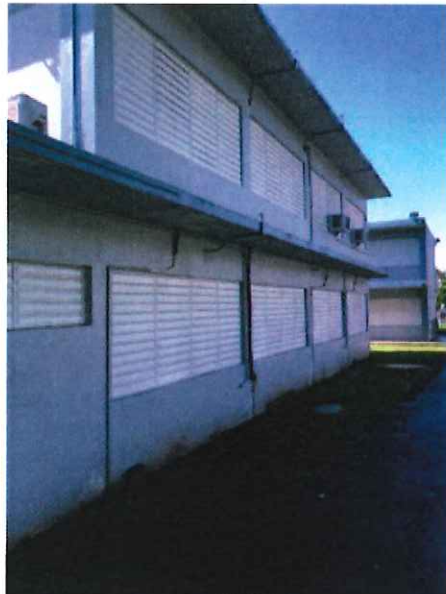
Figure 10 – Short column but no cracks or damage detected