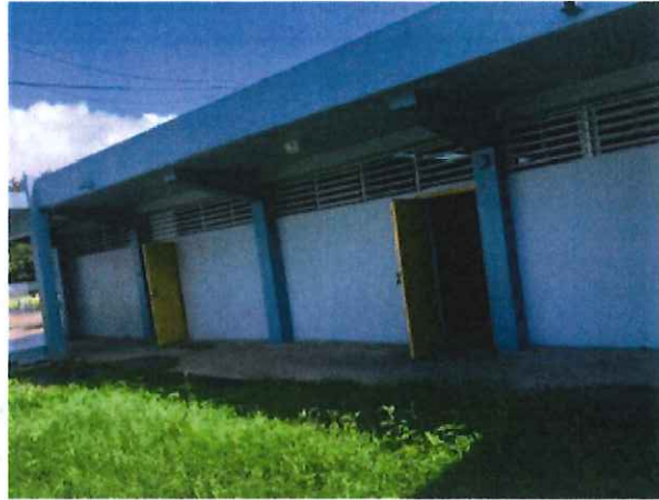
Figure 5 – Short columns with no cracks detected